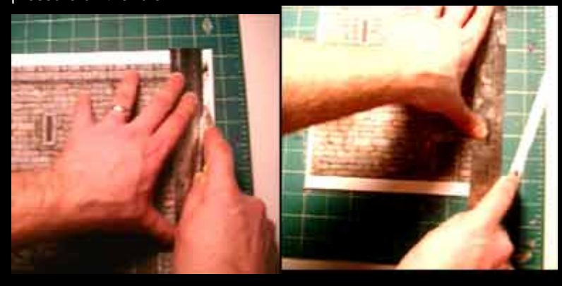
IMPORTANT: Hobby knives are very sharp; you do not need to apply a huge amount of pressure when cutting the paper itself. A light touch is usually all it takes.

5. With one smooth stroke pull the blade along the rulers edge while maintaining downward pressure on the ruler.