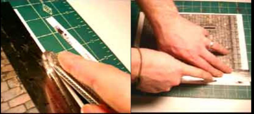
4. IMPORTANT: Apply a small amount of pressure on the blade towards the ruler so that you have firm contact between the two tools. This will ensure a very percise and straight cut.

3. With your other hand place the hobby knife blade against the edge of the ruler.