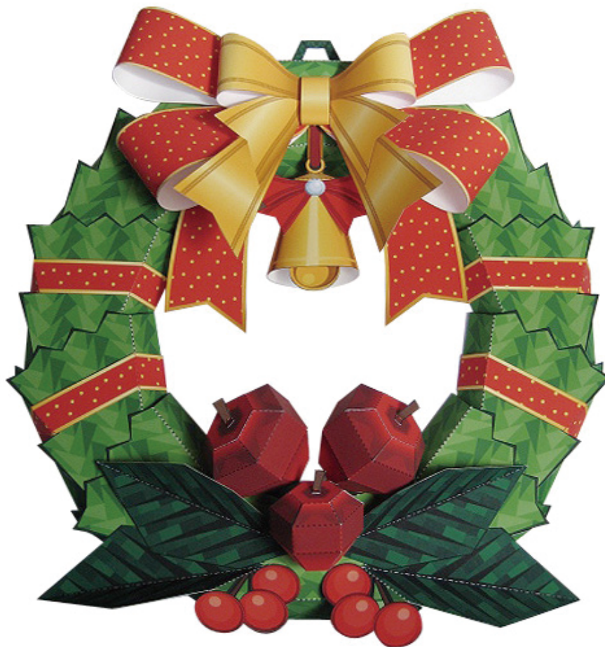
View of completed model